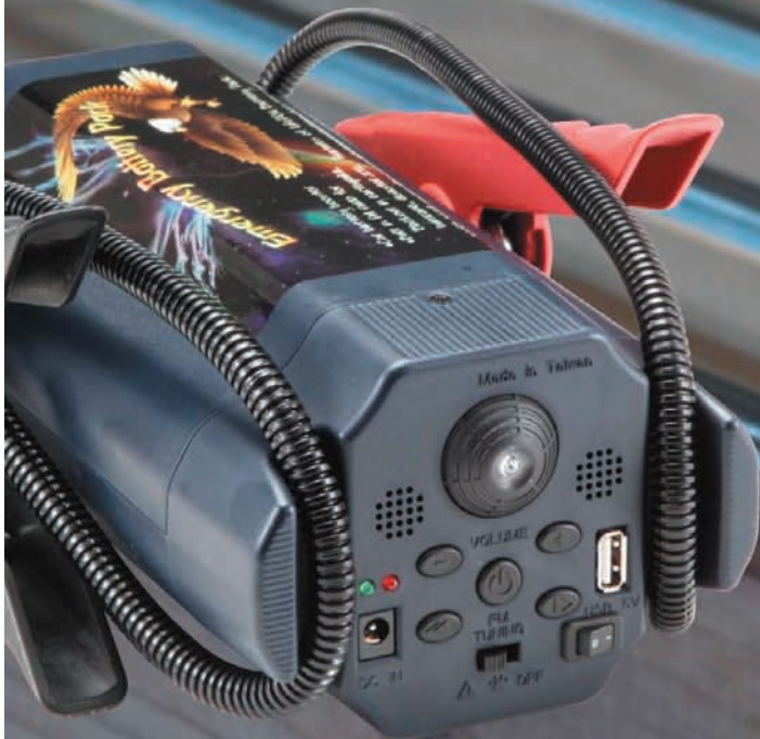
X Series ■

Powered by Lithium Iron Phosphate battery, our "LiFePO4 battery booster pack" is probably the lightest battery booster on the planet. This new generation battery booster pack is compact, light and high rate discharge power. Moreover, it's about 5 times longer of service life than a lead acid based one.