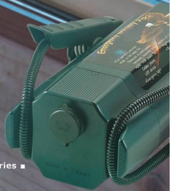
S Series ■