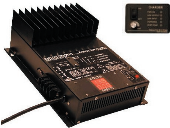
(Shown with Optional Digital Meter)