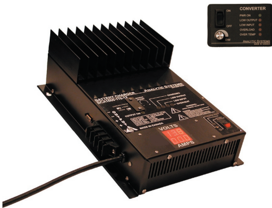
(Shown with Optional Digital Meter)