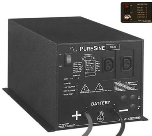
(1000W Unit Shown, 1500W Unit identical in size)