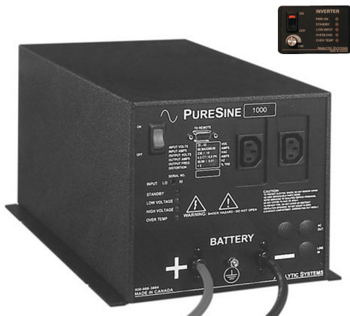
(1000W Unit Shown, 1500W Unit identical in size)