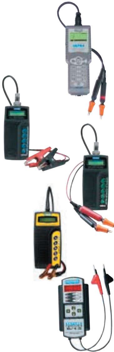
Celltron® Ultra CTU-6000

Midtronics offers professional battery analysis tools for a variety of industrial/stationary power applications. From the smallest 1.2 ampere hour VRLA to 6000 Ah flooded cells, Midtronics can provide equipment for effective battery assessment.